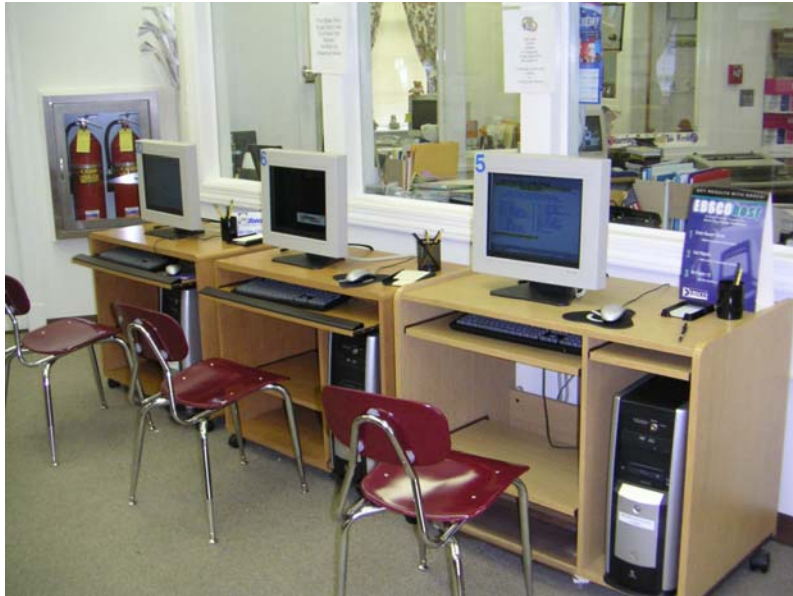
Delmar Computer Area