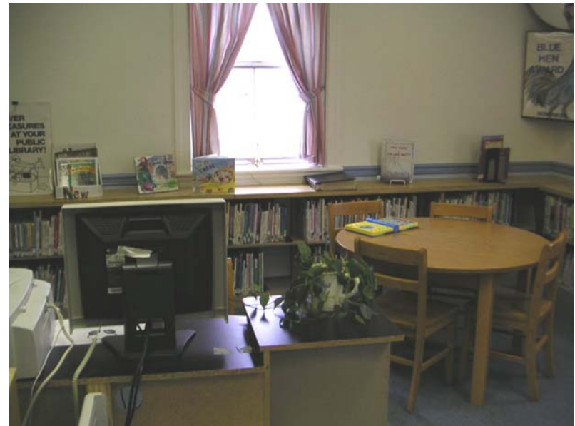
Delmar Children's Area