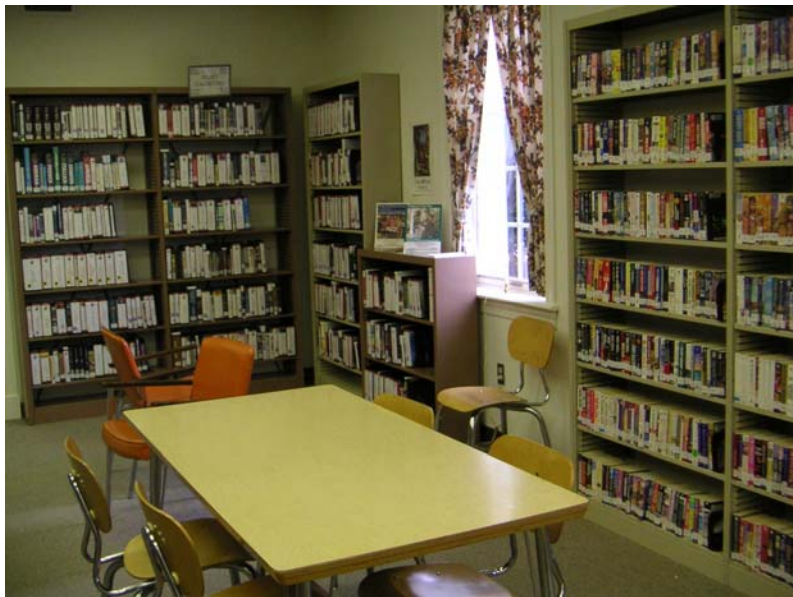
Delmar Adult Area