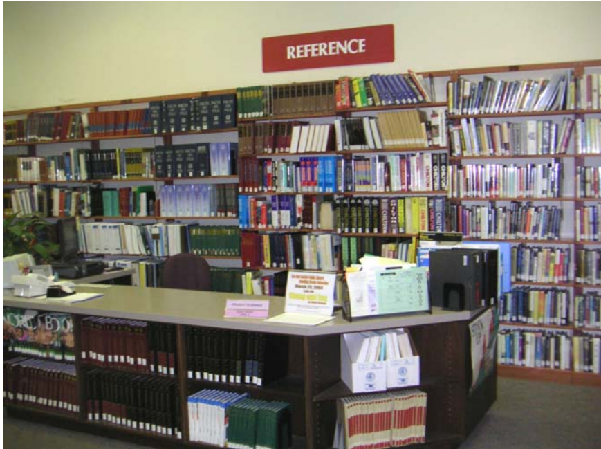
New Castle Reference Area