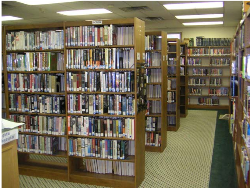
Selbyville Adult Stack Area