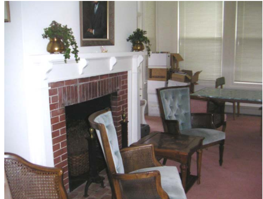
Selbyville Historic Interior