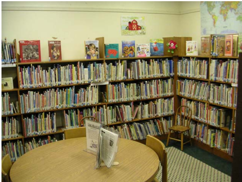
Selbyville Children's Area