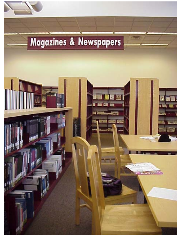
Bear Adult Periodical Area