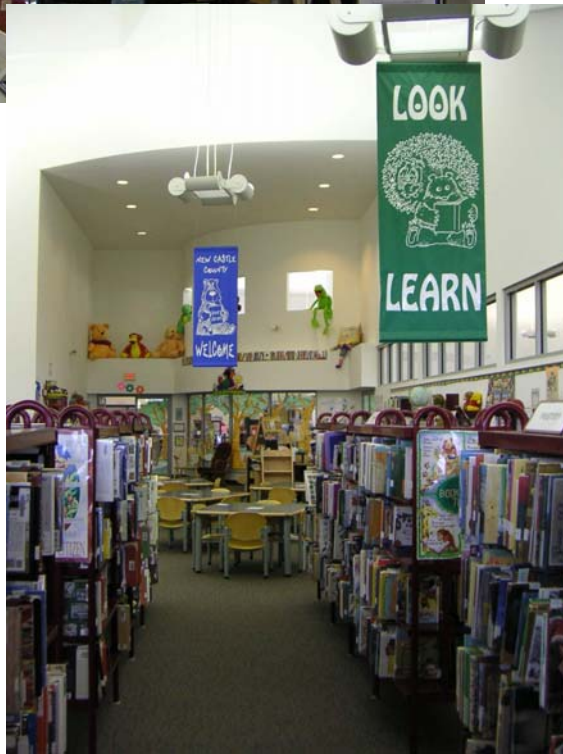
Bear Children's Area