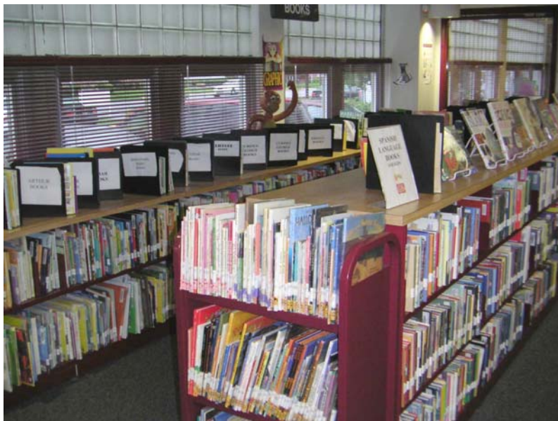
Claymont Children's Area