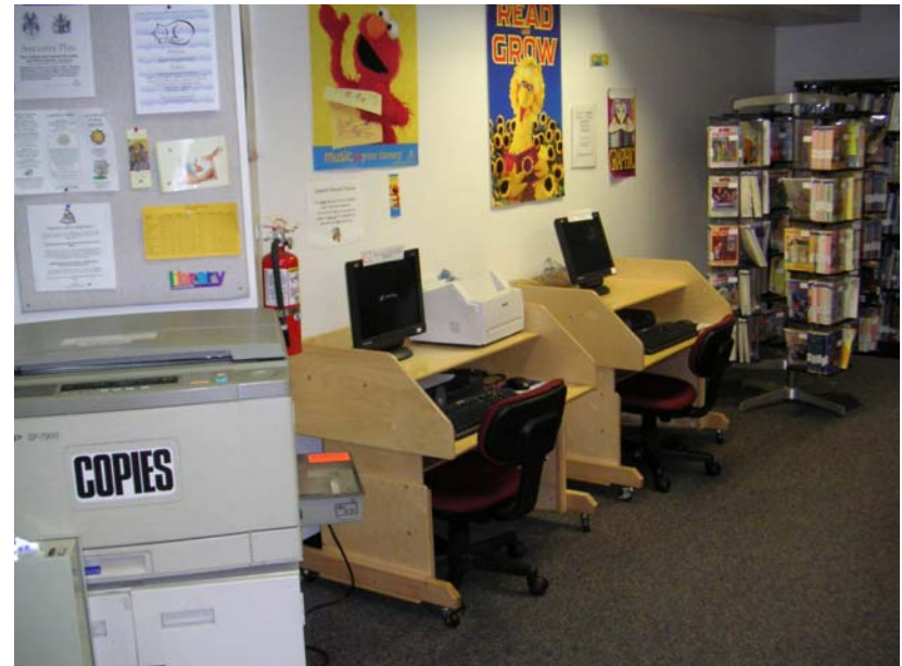
Claymont Computer Area