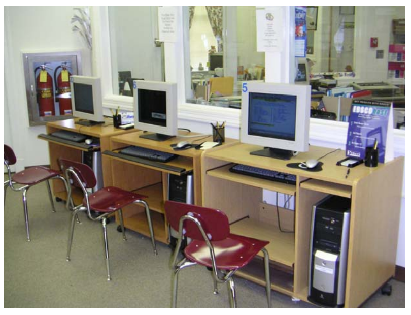
Delmar Computer Area