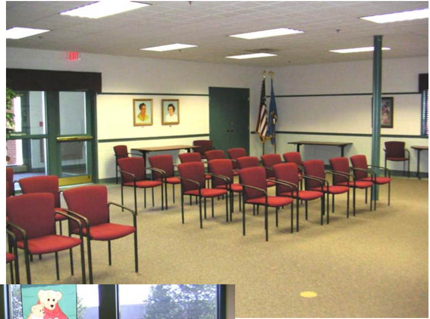
Milford Meeting Room