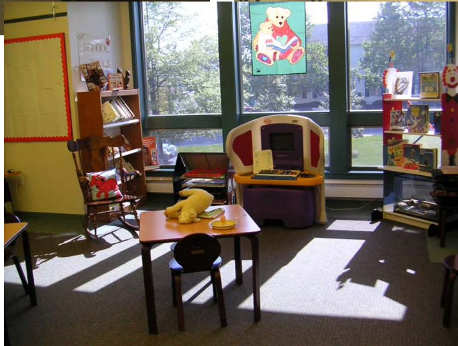
Milford Children's Area