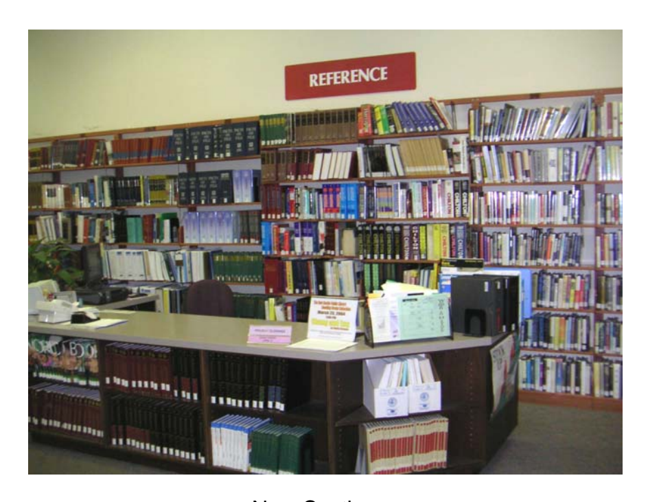
New Castle Reference Area