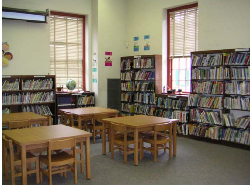
New Castle Children's Area