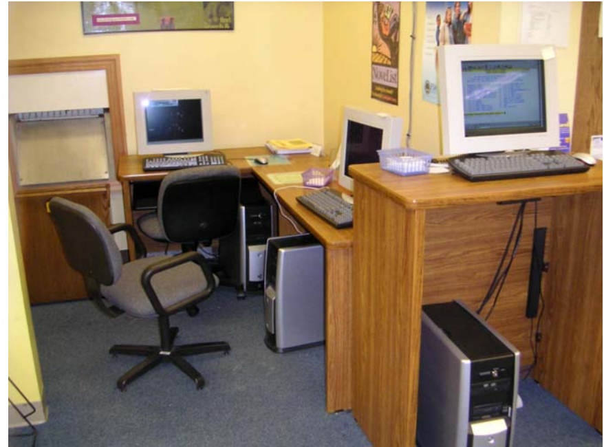
Seaford Public Computers