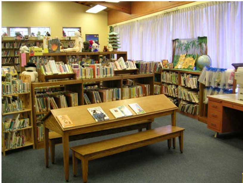
Seaford Children's Area