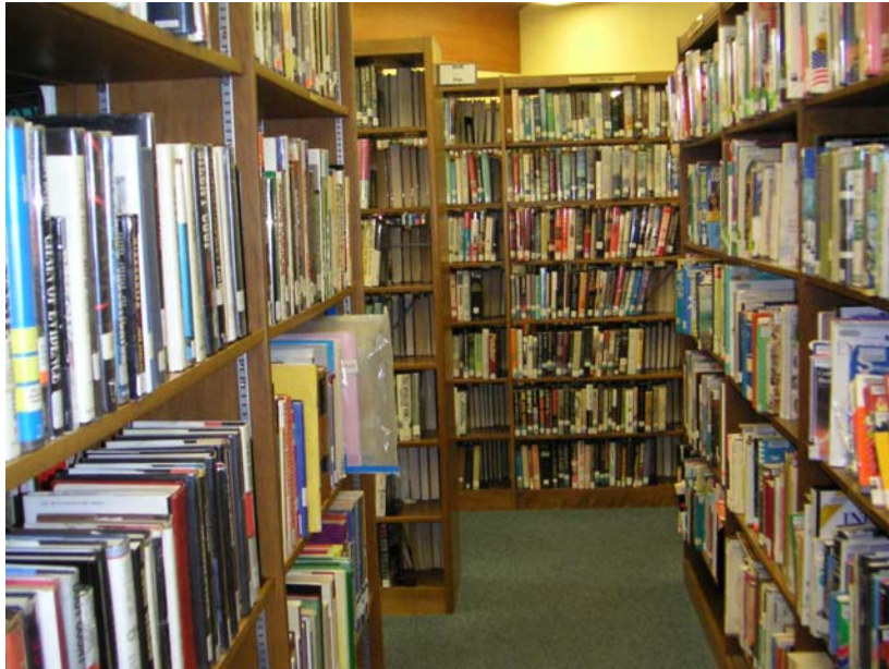
Seaford Adult Stack Area